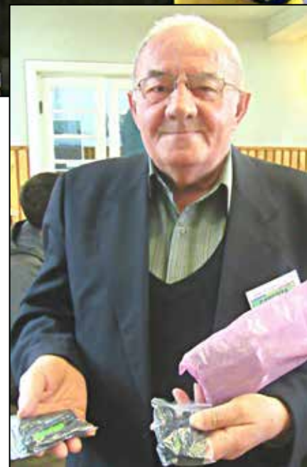
Audio Bibles on MP3 players